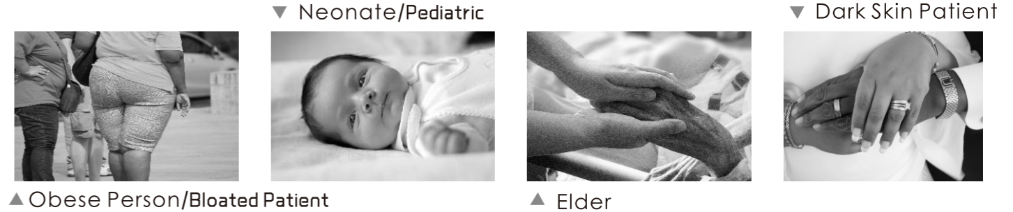
▲ Obese Person/Bloated Patient