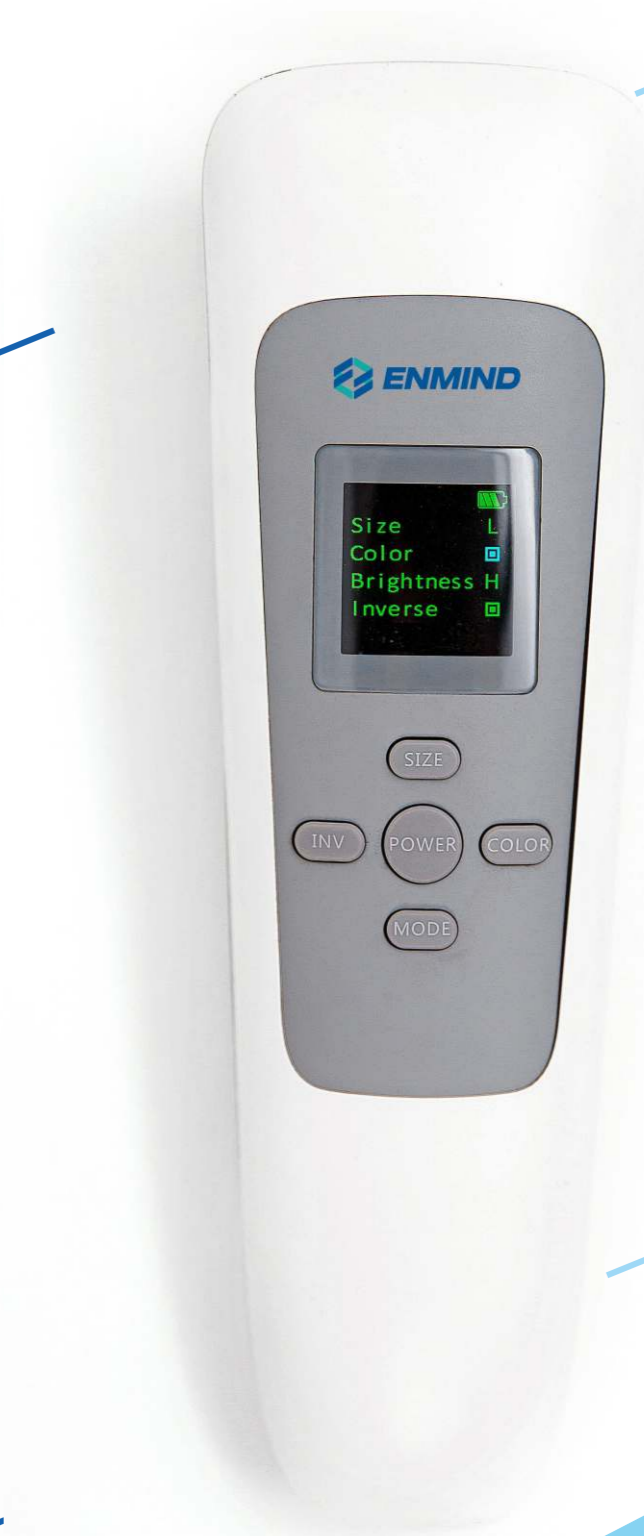
VV-100 Vein Viewer

Shenzhen Enmind Technology Co.,Ltd. Add: Room 201,Block A,No.1,Qianhai Road 1, Qianhaishen Port Cooperative District, Shenzhen,518000,P.R.China. Tel:+86(0755) 2331 6007 E-Mail: sales@enmind-tech.com